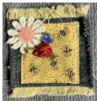
Twinchie by Rhonda Denny

"Artist Trading Cards" (ATCs: Artist trading cards - Wikipedia ) are 3-1/2" x 2-1/2" bits of art. "Inchies" are the same sort of thing, but are 1" square, and "Twinchies" are 2" square. ( How to Make Easy and Fun Inchies and Twinchies ) Many of the same techniques can be used on postcards, or on 4" or 6" squares of otherwise ugly fabric. So there should be something for everybody. I first ran into "inchies" on the late elenor peace bailey's web site. She spoke of making books of these into earrings to wear to a family wedding. Hers were mainly fabric embellished with many things, especially beads.