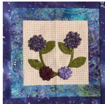
For Elaine Ramires