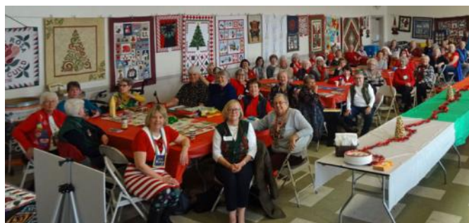
Holiday Potluck 2019