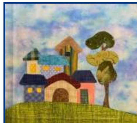
Friendship Block by Sue Gragg