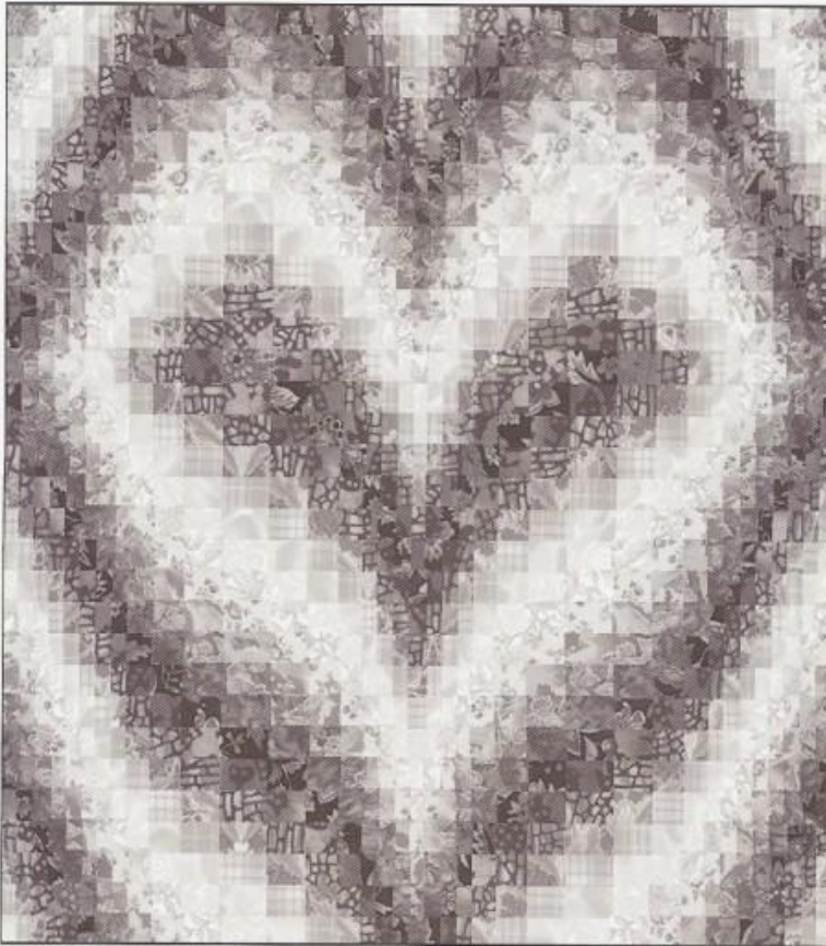
Color Family 1