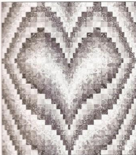
Example 2 Dark to Light, Dark to Light

To keep a smooth color flow in these two examples, one of the color families has 7 fabrics and the other has 5. The difference in appearance results from how the color values of each family are arranged. In Example 2, the values shade from dark to light/dark to light. In Example 3, the two color families shade from light to dark/light to dark.