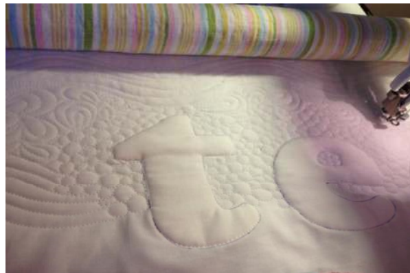
Fig 3: This quilt mixed quilting styles throughout and as a result had the all sorts of shapes flowing all over the place.