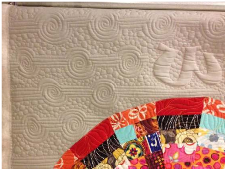
Fig 2: This pebble design bleeds into horizontal lines and crazy-worm-feathers. The irregular shape helps the motion in the quilting itself.

Fig 1: The pebbles around the trapunto letters work their way into the quilt design in alternating rows of swirls and pebbles.