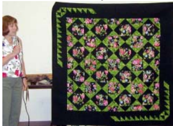
Pat Meiswinkel - Hummingbird Quilt