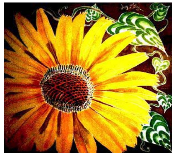
Silk Painting by Joy Lily

"Dyeing to Tell You" with Joy Lily will be our informative presentation in May. Joy's talk and slide show will cover many topics related to dyes and colors as well as "sex, drugs, food, and good books". The workshop, Shihbori Scarf Dyeing, on Friday will explore Arashi shibori—pole wrapping—the Japanese grandmother of tie-dyeing—to fold, wrap and dye multiple colors making white silk scarves into fabulous colorful wearable art. You may also bring your own cottons to shibori dye for quilting! All materials are provided for this class.