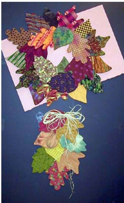
Two samples of the Autumn Leaf Wreath

shop booth. A supply list and the location of the workshop will be distributed at the July 3 TSW meeting with Lavella.