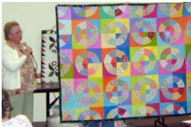
Patty Ford's colorful circles