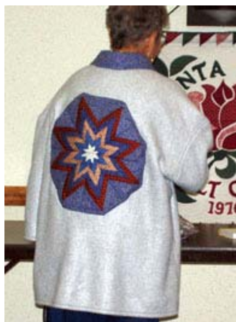
Estelle Carstarphe's coat with Quilt Applique