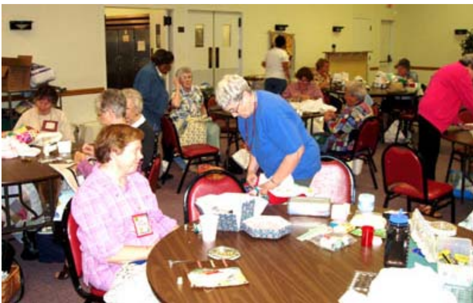
Lavella's Sweat Shop