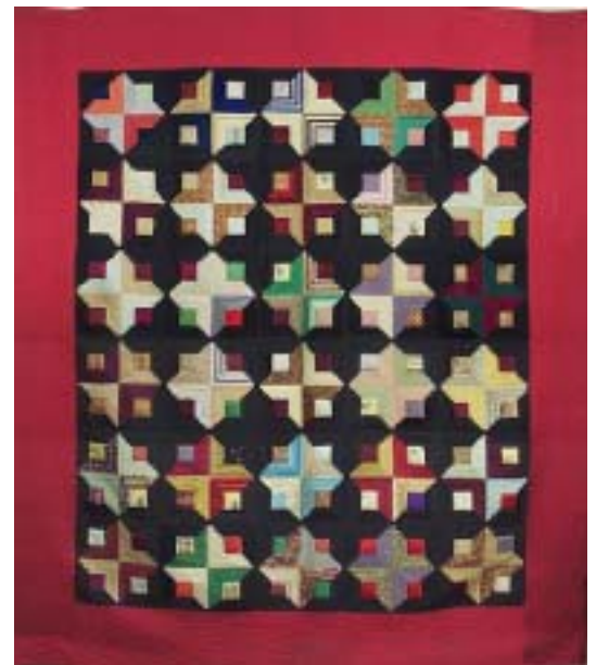
Antique silk log cabin quilt