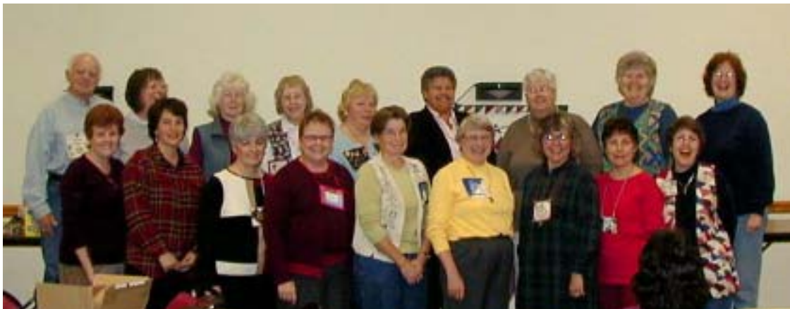
2003 SRQG Board