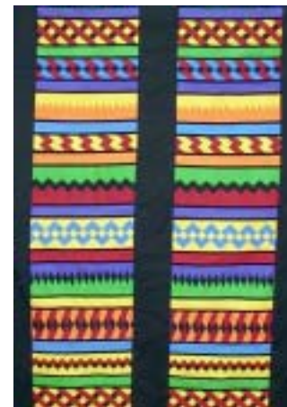
Seminole Piecing Sampler