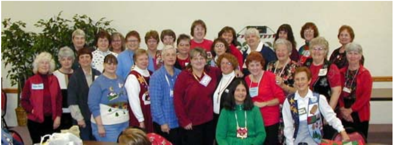
2004 Santa Rosa Quilt Guild Board