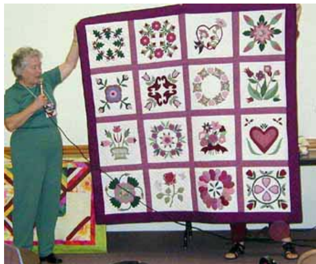
DOROTHY INGHAM'S APPLIQUE QUILT