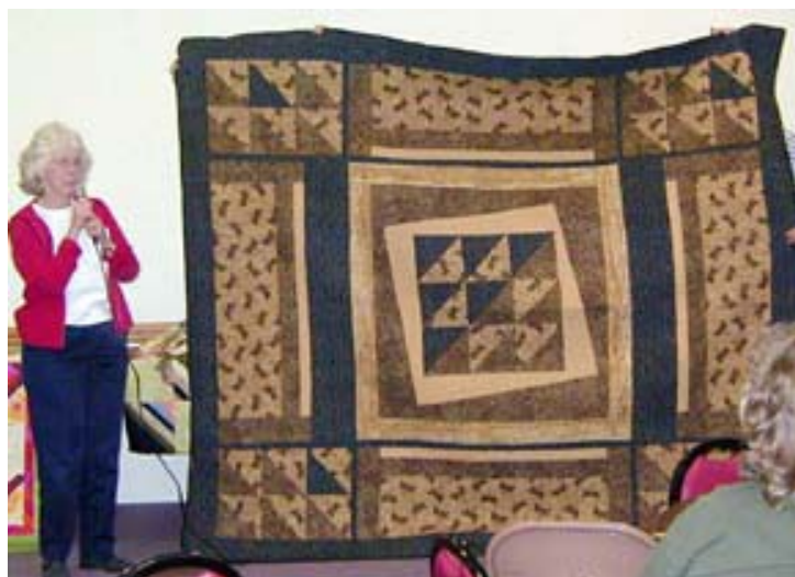
LINDA SIM'S NIGHT FLIGHT