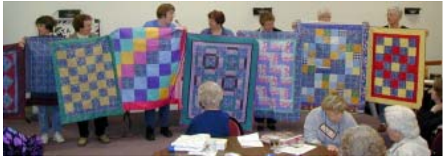
Some of the Quilt Tops Using Challenge Fabric