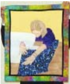
Rae Lewis - Portraits of Granddaughters