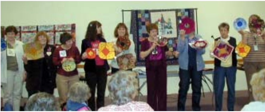
Fabric Bowls for the Boutique