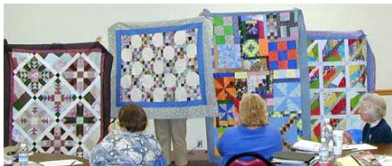
Orphan Block Quilts