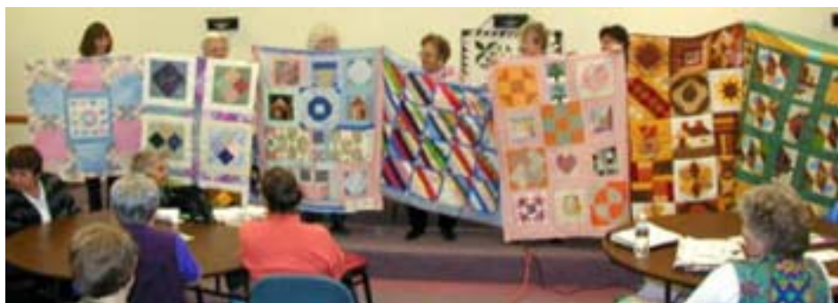
Orphan Block Quilts