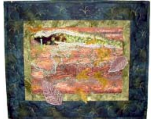
Sample of Diane's Work

The workshop, on March 21, will be FREE MOTION EMBROIDERY AND QUILTING . You will need a sewing machine with the ability to drop the feed dogs. The rest will be learning to hand guide the machine in creating a variety of embroidery effects.