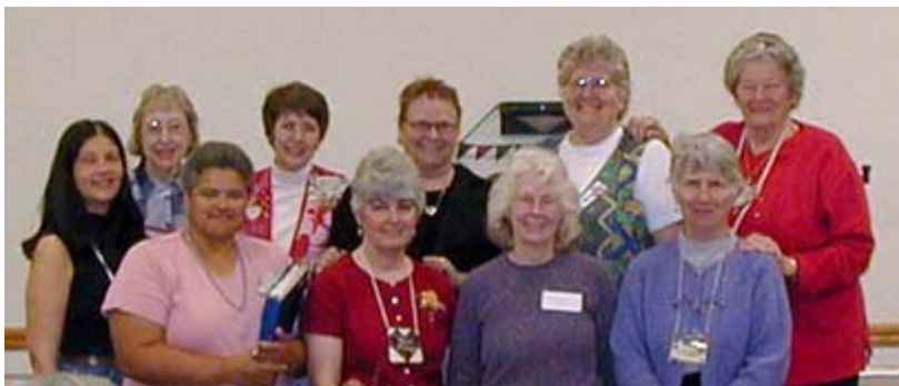
Some of the 2002 Technique Sharing Workshop Instructors