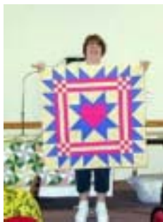
The Mystery Quilt Diva and the 2004 Mystery Quilts