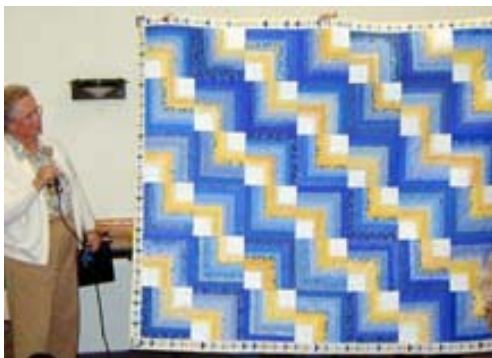
Patty Ford - Lightning