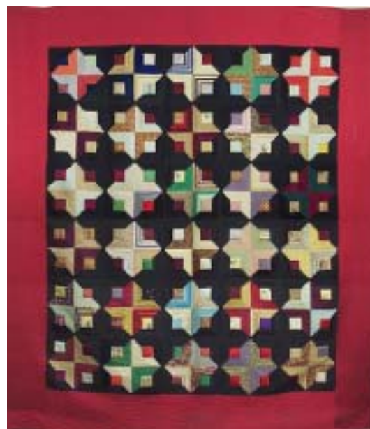
Antique silk log cabin quilt