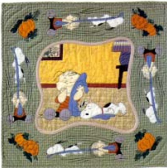
Security by Itsuko Ajimine

730 BENNETT VALLEY ROAD • SANTA ROSA, CA • 95404